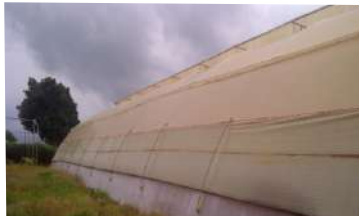
Skirting Fibres / Side Curtains

Available in different mesh size. i.e 30, 40 & 50 Mesh