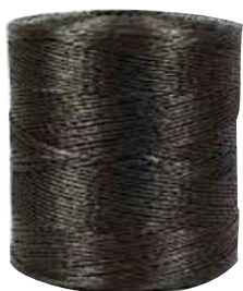
Crop Support Ropes / Baling Twines

Available in different thickness: 20 - 100 micron thickness.