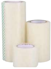
Green House Tapes

Green House tapes are self adhesive and uv treated for repair.