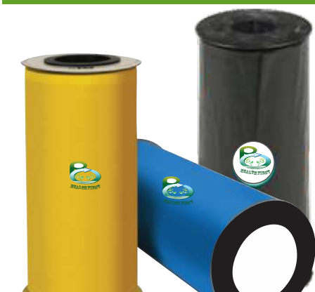
Catch Master Rolls (Blue, Yellow & Black)

Pressure and Trigger types available in 0.5, 1, 1.5 & 2L.