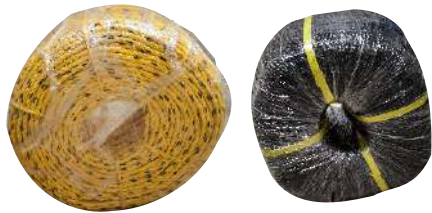
Green House Ropes

Available in different thickness from 6, 8 and 10 mm, These are UV stabilized with high mechanical strength.