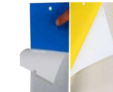
Catch Master Cards (Blue & Yellow)

Catch Master Cards are glued on both sides and are punched at the top for easy installation hence increasing the contact surface area.