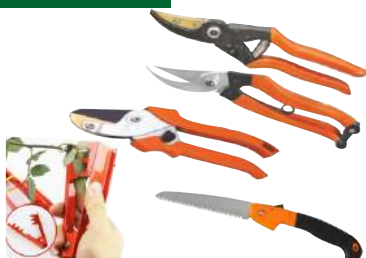
Secateurs/ Pruning Shears

Made of Brass, both durable and rust resistant.