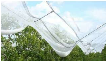
Anti Hail Net

Available in different thickness from 6, 8 and 10 mm, These are UV stabilized with high mechanical strength.