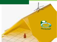
Delta Traps & White Sticky liners

Delta traps are ideal for use with pheromone lures to monitor populations of moths. Bio Organic Delta Trap is made of strong corrugated plastic with a UV resistant coating, making it resistant to rain and degradation by sunlight.